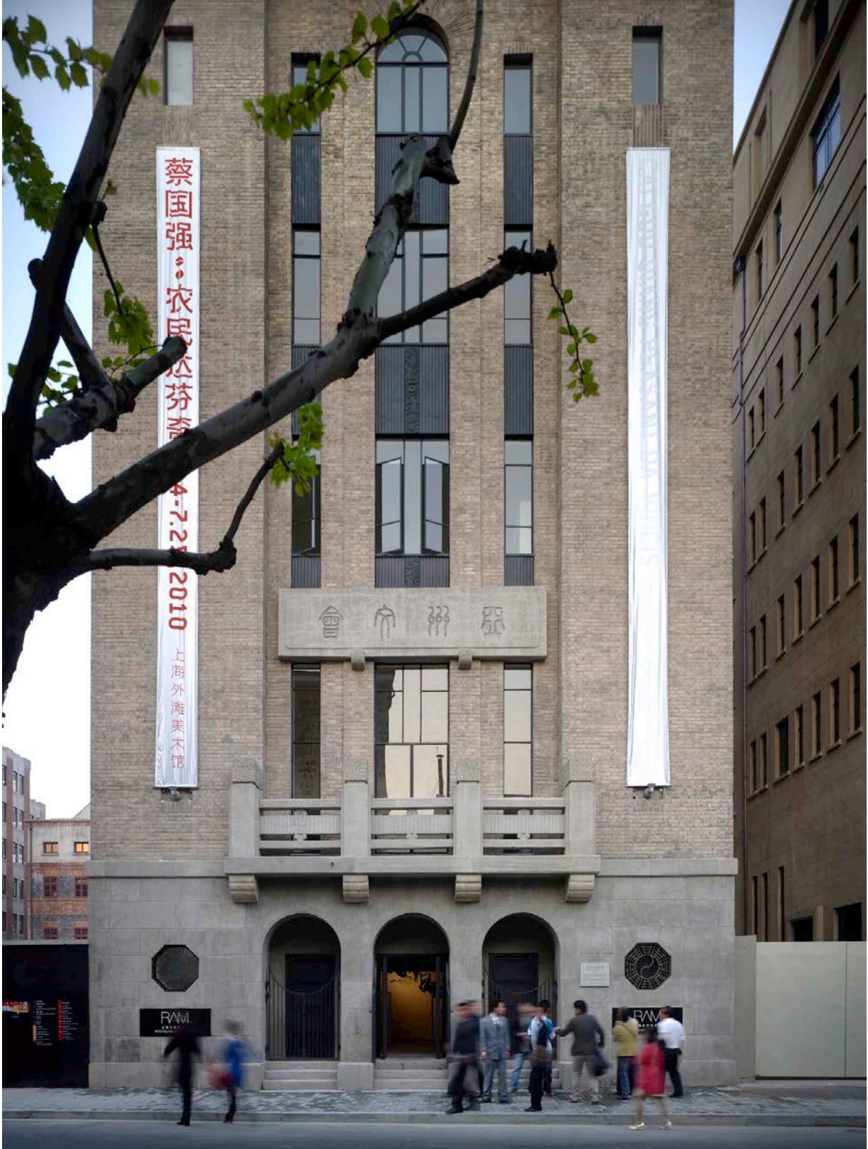
Rockbund Art Museum