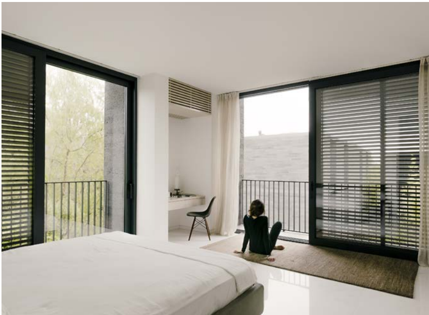
Xixi Wetland Estate