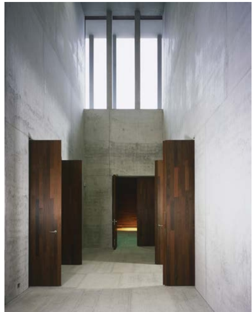
Museum of Modern Literature