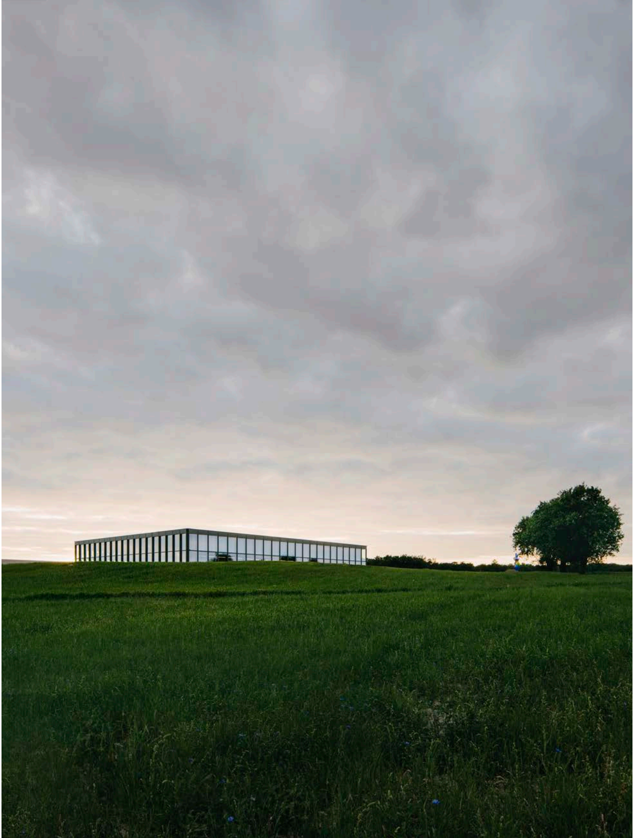
Carmen Würth Forum